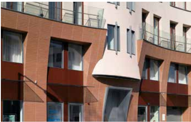
Hotel Messerschmitt, Bamberg, Germany Architect: Architectural office Seemüller, Bamberg, Germany

Whether modern new buildings, listed buildings or the extension of existing buildings - ceramic facade claddings do not only reflect the desired style and particular spirit of the time in a perfect manner, they also offer a great variety of formats, shapes, textures and colours for ventilated rainscreen facades. The carrier board of the StoVentec C system forms an excellent adhesion primer for ceramics and glazed brick slips. Besides ceramic coverings and StoDeco profiles and rustications, the carrier board is also suited for the application of glass (StoVentec G), glass mosaic (StoVentec M), render (StoVentec R) and natural stone panel tiles (StoVentec S).